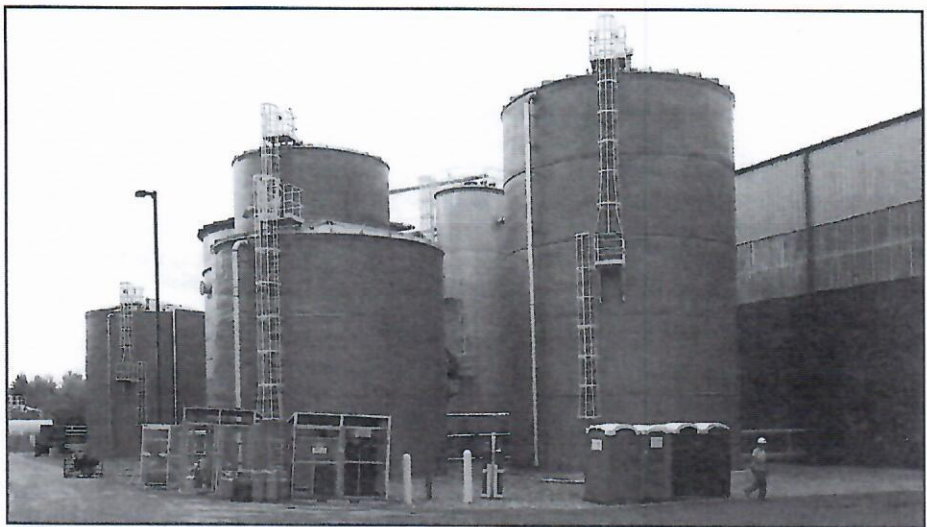
Tanks used in recycling process outside of Fiberight/Coastal Resources plant in Hampden.

which microorganisms break down biodegradable material in the absence of oxygen. In the end, three value-added products are produced, Wright explained.