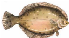
WINTER FLOUNDER ( Pleuronectes americanus )

Size: Minimum size 12 inches. Bag limit: 8 fish per angler per day.