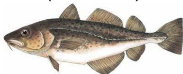
ATLANTIC COD ( Gadus morhua )

Size: Minimum size 21 inches. Bag limit: 1 fish per angler per day. Recreational Season: April 1 -14 and Sept 15-30, inclusively. Charter Season: April 1 -14 and Sept 8-Oct 7, inclusively.