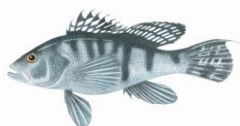
BLACK SEA BASS ( Centropristes striatus )

Size: Minimum size 13 inches. Bag limit: 10 fish per angler per day. Season: May 19 – September 21 and October 18 – December 31, inclusive.